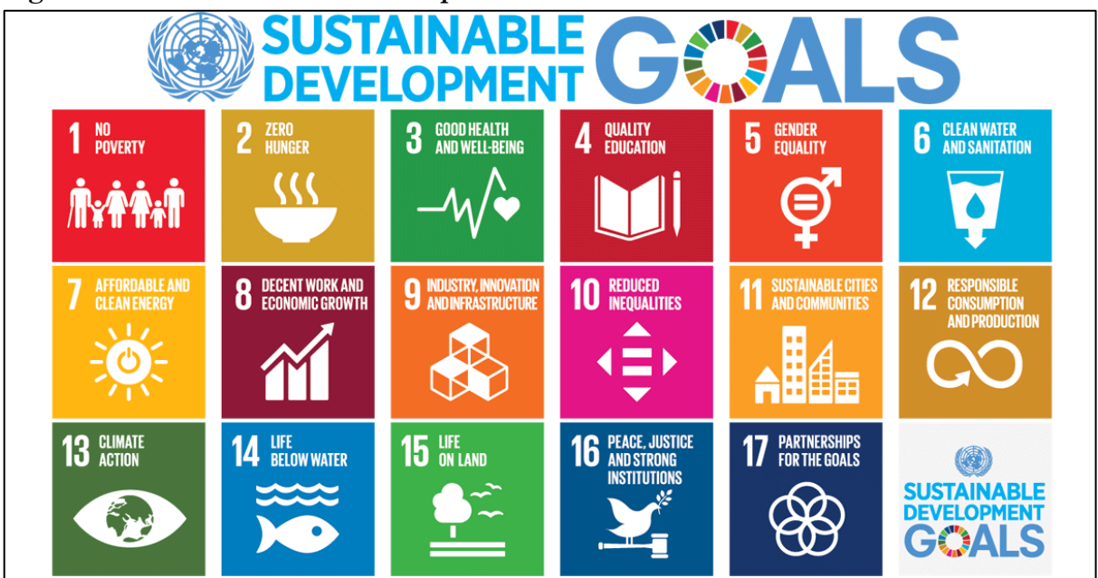
Figure 1: The 17 Sustainable Development Goals

These cover a broad range of fields and development issues such as transport and urban issues, consumption and production patterns, energy, biodiversity and climate change, poverty and health, education and equity, water and desertification, agriculture and food security. SDGs include targets related to the fight against poverty set by the Millennium objectives in the early 2000s. Two SDGs refer directly to economic development, six are social, seven are environment-oriented while two focus on policy governance.