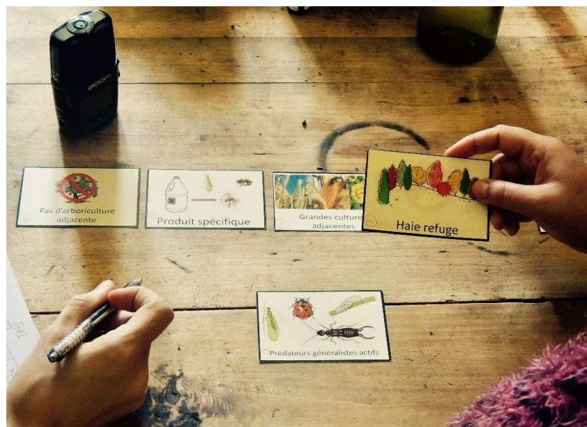
Fig 1 : Eliciting probabilities linking the different nodes of the Bayesian Belief Network

The parametrization of the BBN was a heavy task (time consuming and not always intuitive). To facilitate this process, we used cards with images (Fig. 1) illustrating variables and their different states. Also we opted for questions about frequencies ("Considering A,B and C, in how many cases out of 100 would you observe D?") rather than probabilities, which are more difficult to handle. On the whole, the process lasted 3 hours per stakeholder in order to elicit the 266 probabilities of the whole network.